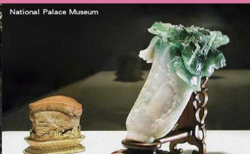
National Palace Museum